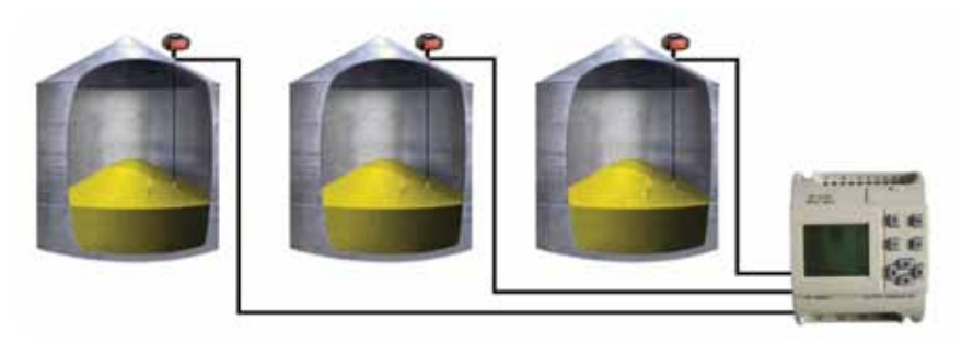
The SmartBob AO features a direct 4-20 mA analog output.

The SmartBob AO with built-in 4-20 mA output can easily replace any 4-20 device by simply installing the SmartBob on the top of the bin and wiring the sensor to the existing 4-20 input. When the SmartBob AO takes a measurement, it automatically transmits an updated analog signal containing the measurement data. The SmartBob AO can be programmed to initiate a measurement utilizing an internal timer to take readings at a predetermined time interval or an external start input can be used to take a measurement immediately, should one be needed. Two configurable relay outputs can be used to alert to measurement status or high, low or error alarms.