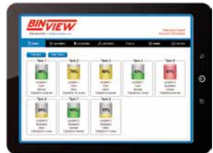
Tank view on a tablet