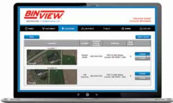
Location view on a PC