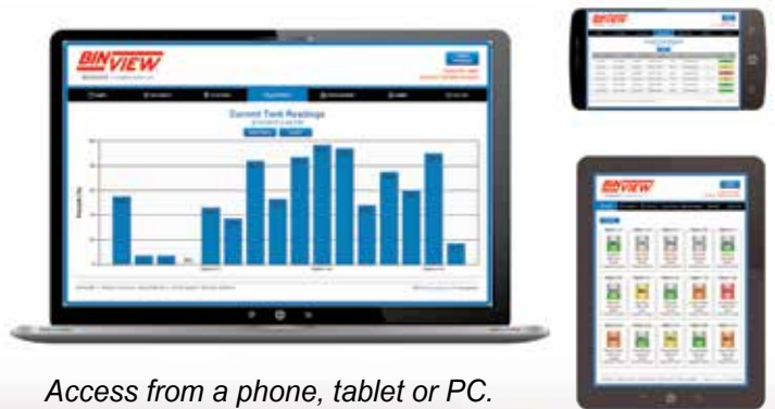
Access from a phone, tablet or PC.